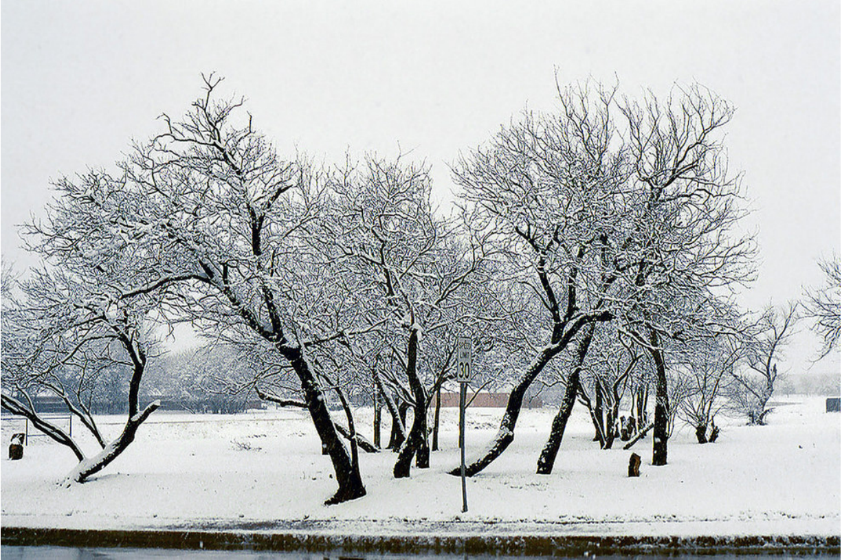
North Richland Hills, TX

22. Fog is not just something you see in London — Texas has its fair share of mystic haze.