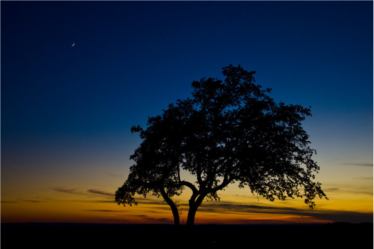
Lago Vista, TX

36. The stars at night truly are big and bright.