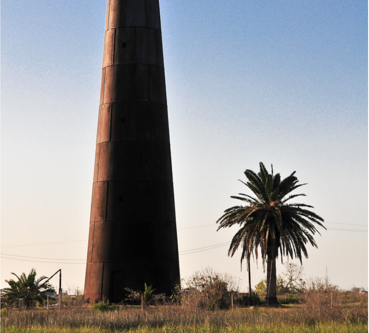
Point Bolivar, Texas

28. Remember, nothing comes close to the beauty of the coast.