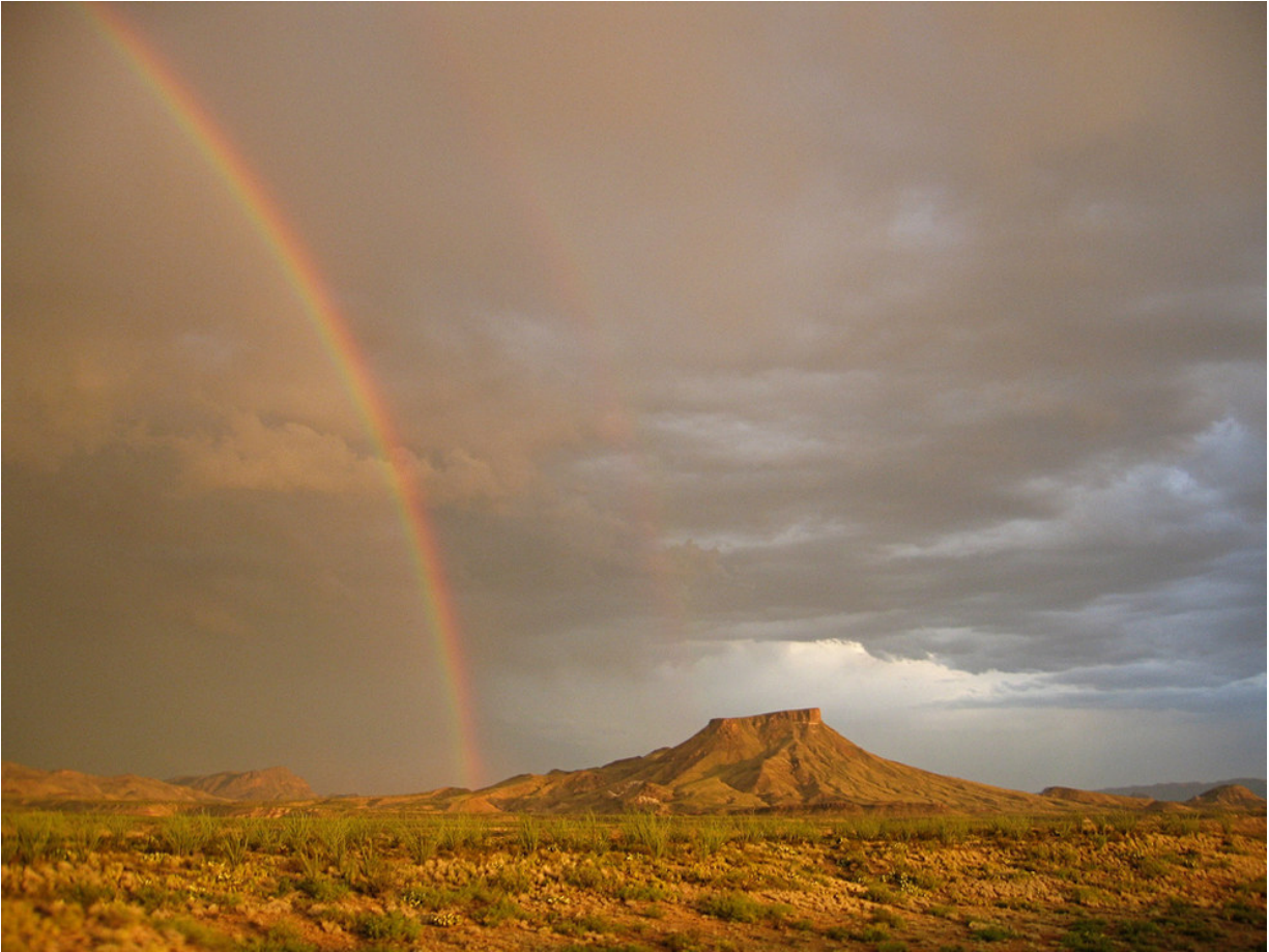
Chihuahuan Desert, Texas

30. They have their own version of wildlife.