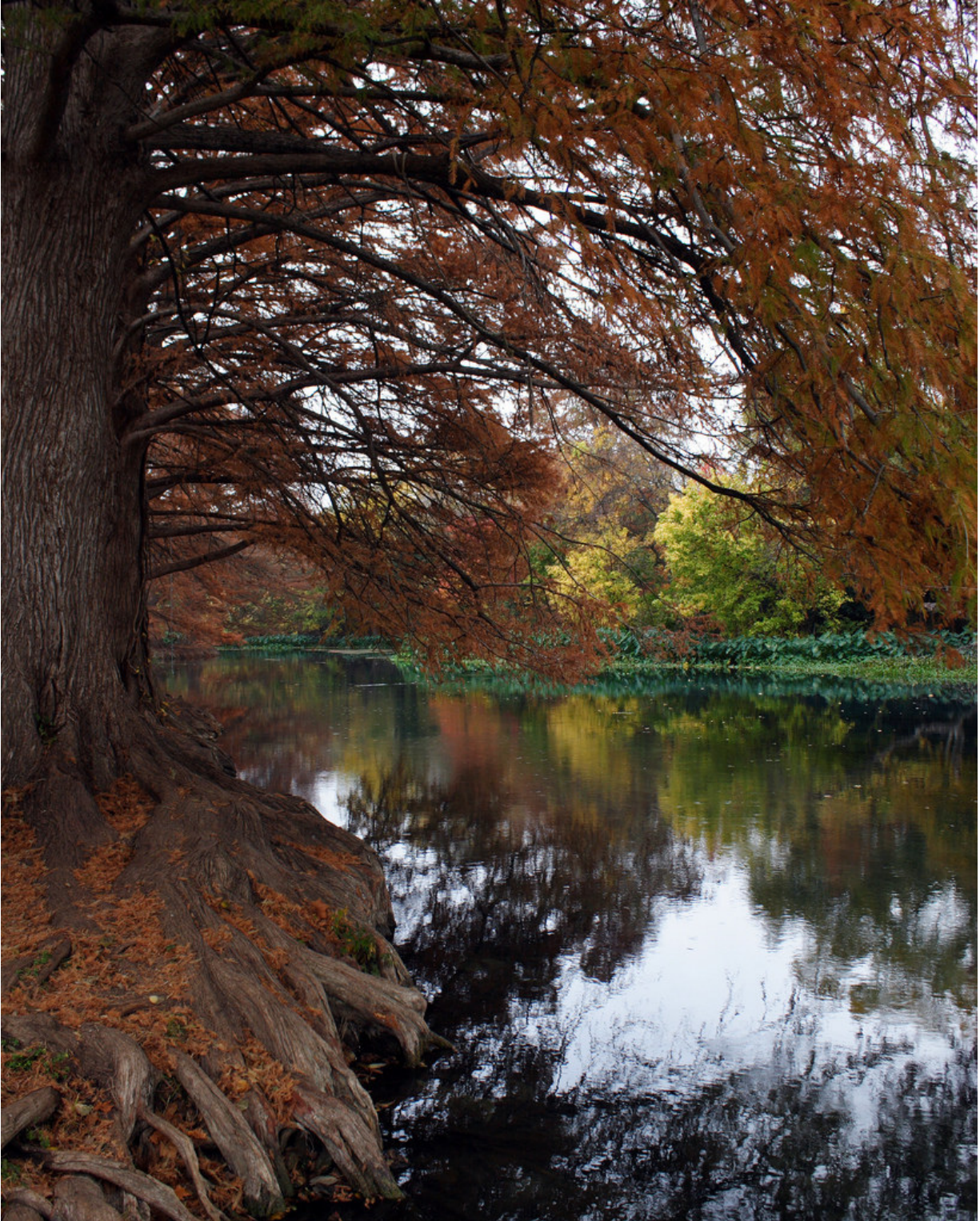
San Marcos, TX