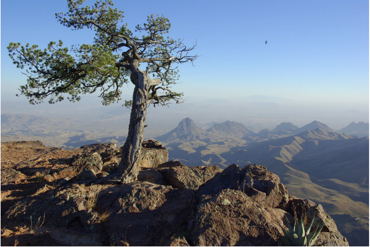
Big Bend, TX

15. Only in Texas will you find amazing colonies of bats aboveground.