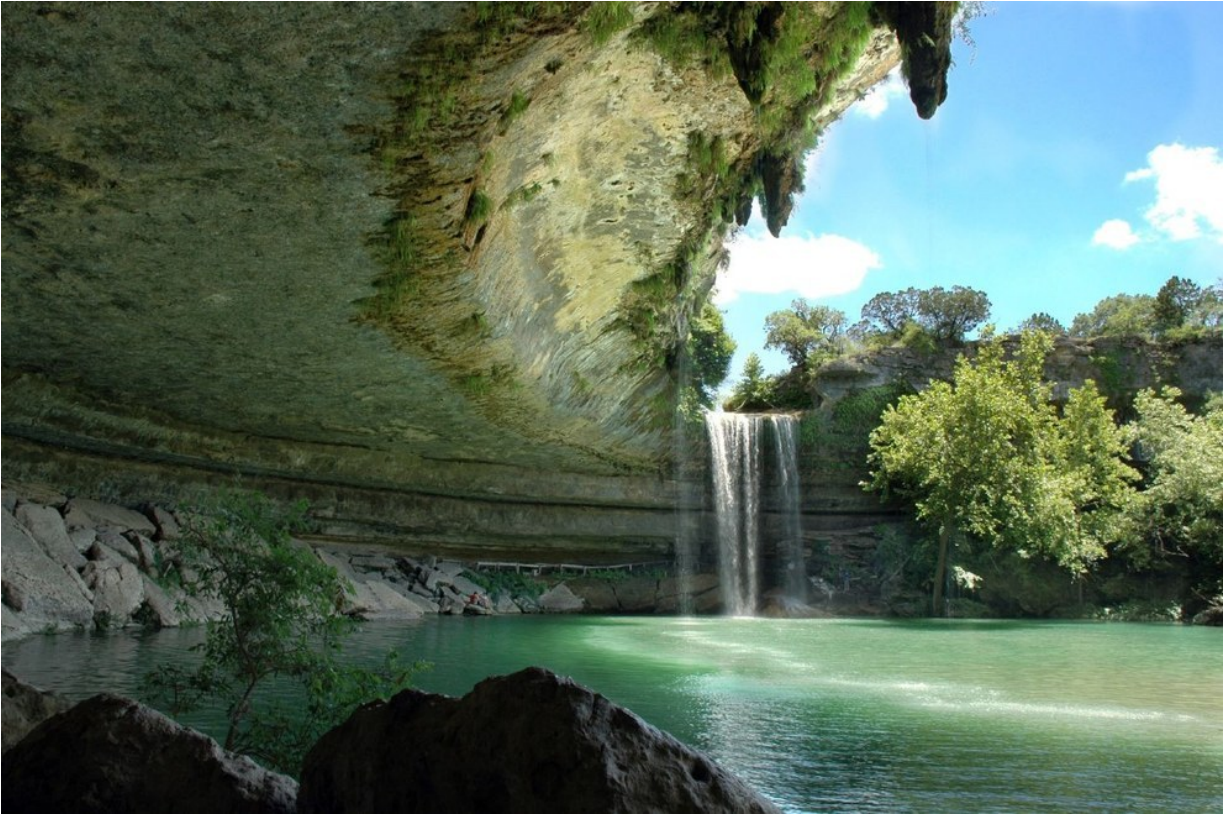
Dripping Springs, Texas

3. As for being dry? Much of Texas is the opposite of that.